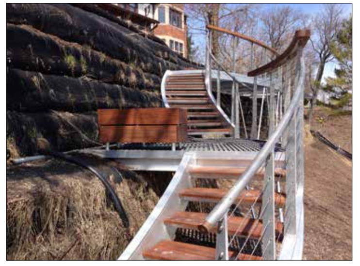
The GreenLoxx LivingWall (dormant here) is the foundation to which the deck and stairs are anchored.

The 90-foot long by 15-foot high GreenLoxx® LivingWall™ consisted of lightweight geo-foam block