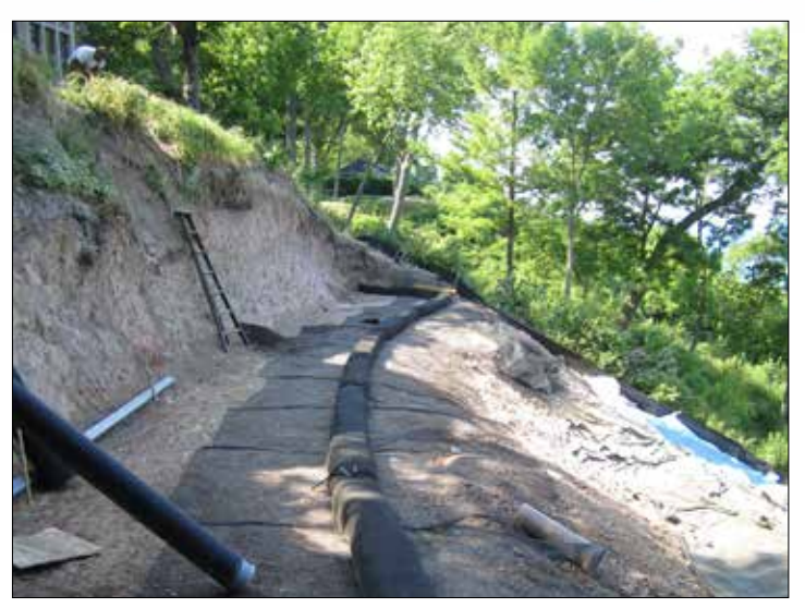
Installation of the GreenLoxx LivingWall

Due to the risk of erosion and for safety reasons, the client sought to stabilize and terrace the east or front yard and provide access to the beach. This led to the decision to utilize a living wall. This low impact solution promotes the growth of native plants for both a natural aesthetic as well as stabilization properties.