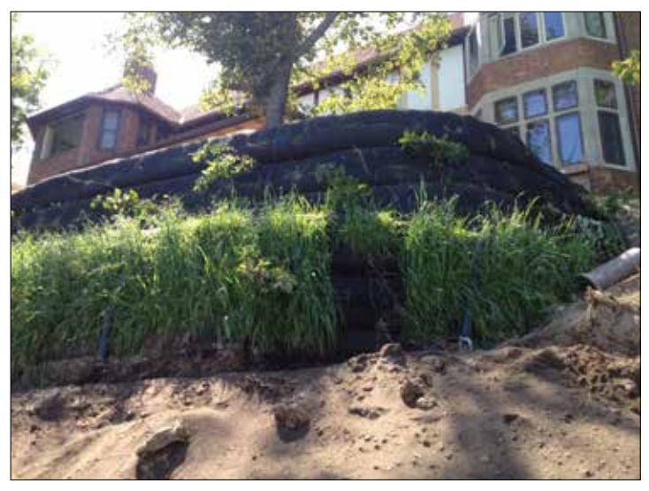
Construction of the upper wall is complete.

With only five feet of space between the historic neighboring house and that of the clients, many materials were hand carried. Weight and size of assemblies were