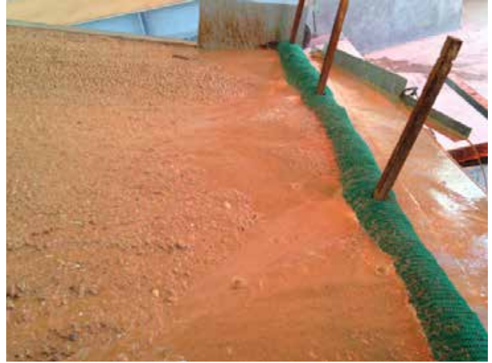
Figures 4 & 5: Sediment accumulation at end of 60 minute rainfall event

Finally, 5-inch diameter SiltSoxx for Slope Interruption will provide optimum performance on similar slopes, as this BMP is designed specifically to slow sheet flow runoff on hillslopes to reduce soil erosion. Overtopping of the SiltSoxx in these applications is part of the design and intent of the BMP.