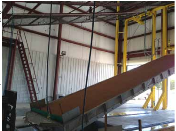
Figures 2 & 3: Test plot with treatment installation at Texas A&M Texas Transportation Institute Sediment and Erosion Control Laboratory.