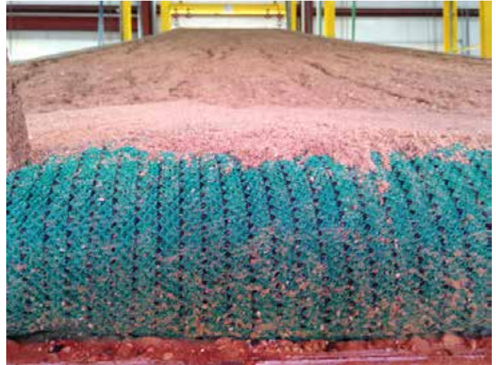
Figure 1: Testing of 5-inch SiltSoxx

Performance of sediment control barriers and slope interruption devices are of increasing concern to designers, regulators, and contractors. Historically, very little research has focused on developing best management practices (BMP) to fit a variety of site slope and rainfall conditions. For example, sites with nearly flat slopes or in areas with lower rainfall accumulation potential (or design storms below the national average) likely do not require sediment control barriers designed for runoff and sediment storage needed for sites with 3:1 (H:V) slopes and four inches of rainfall accumulation. Over-design of BMPs is just as commonplace as under-design of BMPs within the erosion and sediment control industry. Providing a correctly designed BMP for the site can offer substantial cost savings to the land owner. The objectives of this study were to determine the performance of: 1) a 5-inch diameter SiltSoxx on a 5% slope under a 2-inch design storm; and 2) a 5-inch diameter SiltSoxx on a 3:1 slope under a 2-inch design storm.