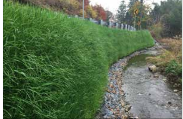
GreenLoxx MSE, after