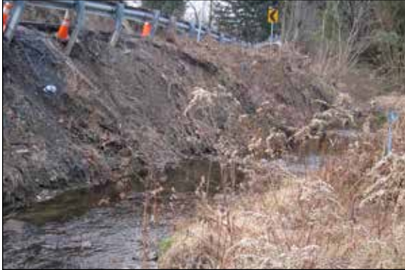
Roadway project site, before