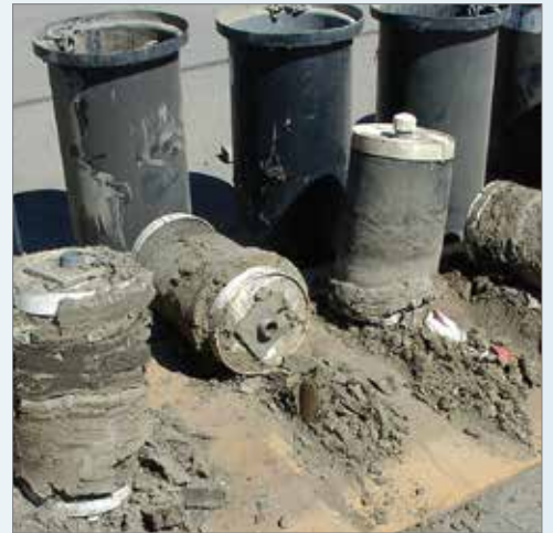
StormExx collects large amounts of sediment and debris in an easy to replace cartridge.