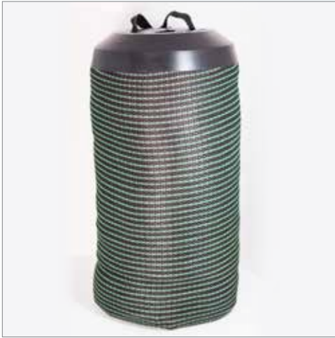
StormExx uses similar EnviroSoxx® filtering media and additives to treat stormwater in a replaceable cartridge for under the grate.