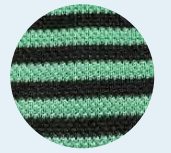
Advanced Blend Identification: black and light green stripes