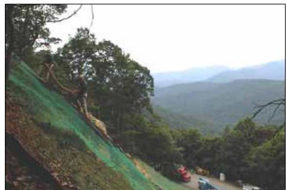
LockDown Netting Installation