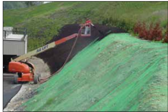
Compost Erosion Control Blanket being applied over Lockdown Netting.