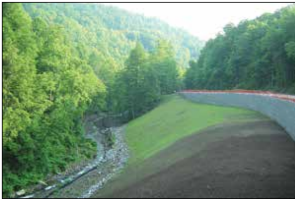
Compost Erosion Control Blanket.