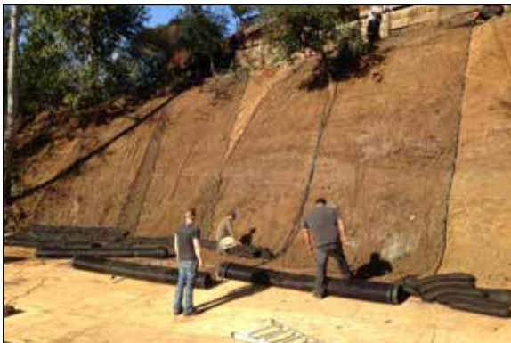
Project site, GreenLoxx Non-MSE Installation

Engineer shall notify Filtrexx of location, description, and details of project prior to the bidding process so that Filtrexx can provide design aid and technical support.