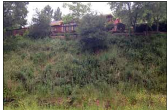
GreenLoxx Non-MSE, after

Contractor shall protect the materials from damage, as damaged materials shall not be used in the project.