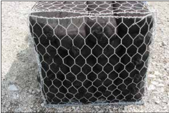
GroSoxx Gabion Before