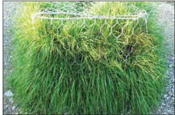
GroSoxx Gabion After