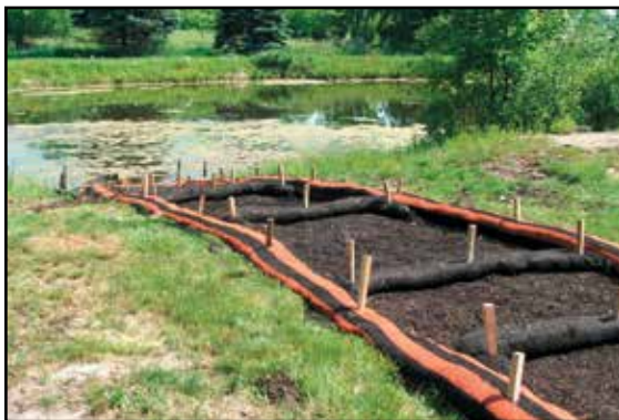
Filtration “cell” system installation