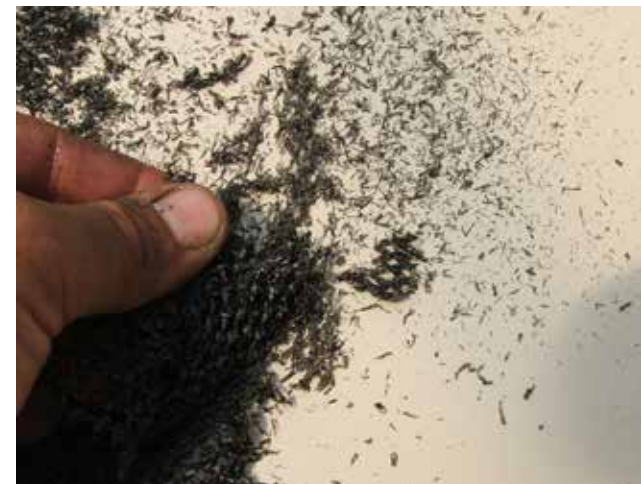
Filtrexx oxo-biodegradable HDPE

For applications where Filtrexx<sup>®</sup> Soxx<sup>™</sup> are permanentley vegetated, the canopy shields the Soxx from destructive UV exposure, which will also make the Soxx invisible. This permanent UV protection ensures long term structural integrity to Soxx and is an important design consideration for any long term, vegetative application.