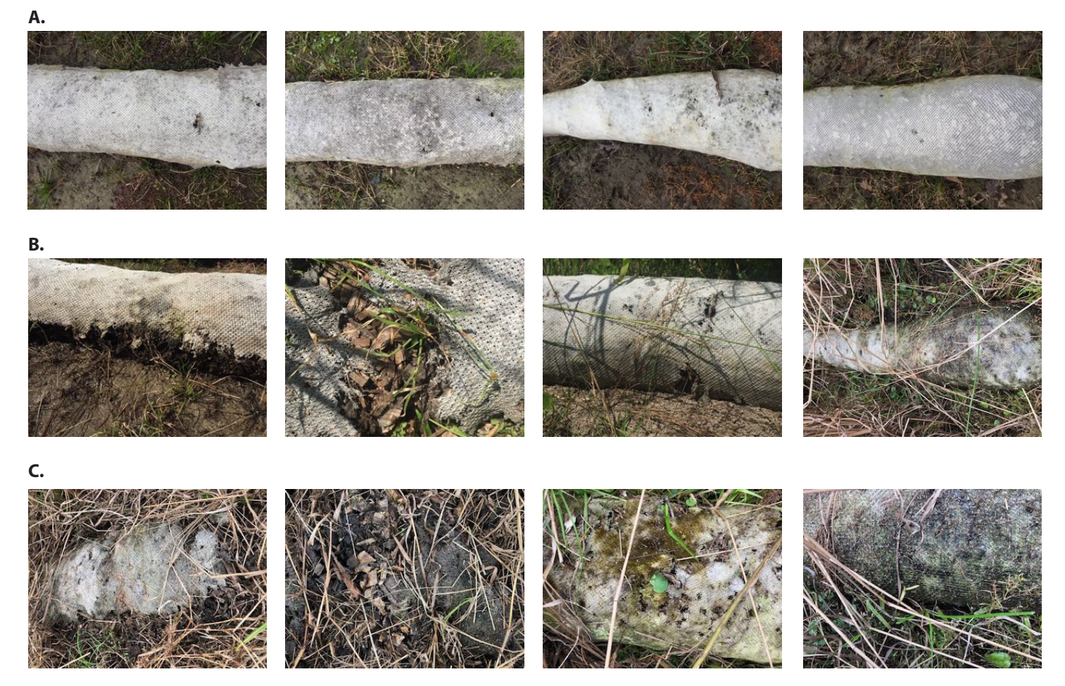
Figure 3. Biodegradation and photodegradation of each material at A) 6 months, B) 12 months, and C) 18 months (from left to right – cotton fiber, flax fiber, wood fiber, PLA).