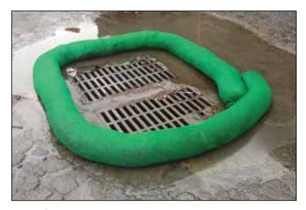
Drain Inlet Protection