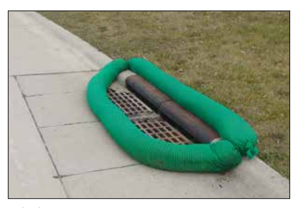
Curb Inlet Protection