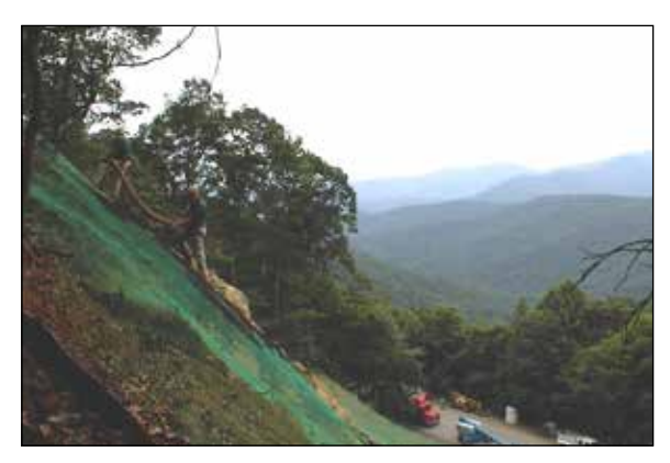
LockDown Netting Installation